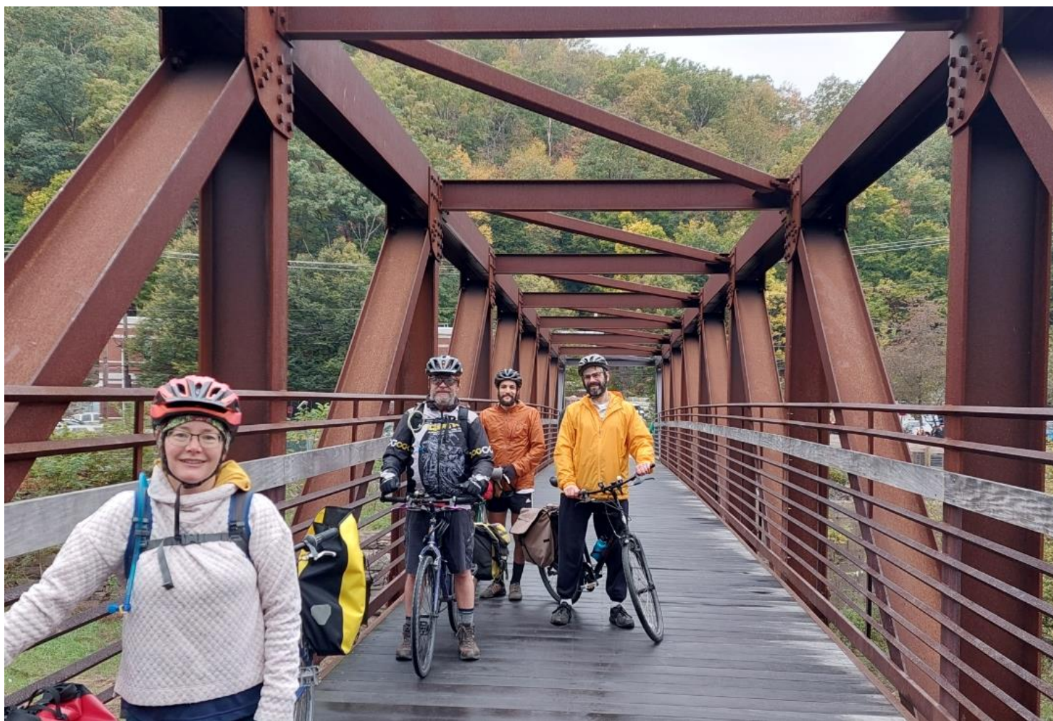
CAT Bike Camping Trip to Jim Thorpe

What an amazing community! Thank you everyone!