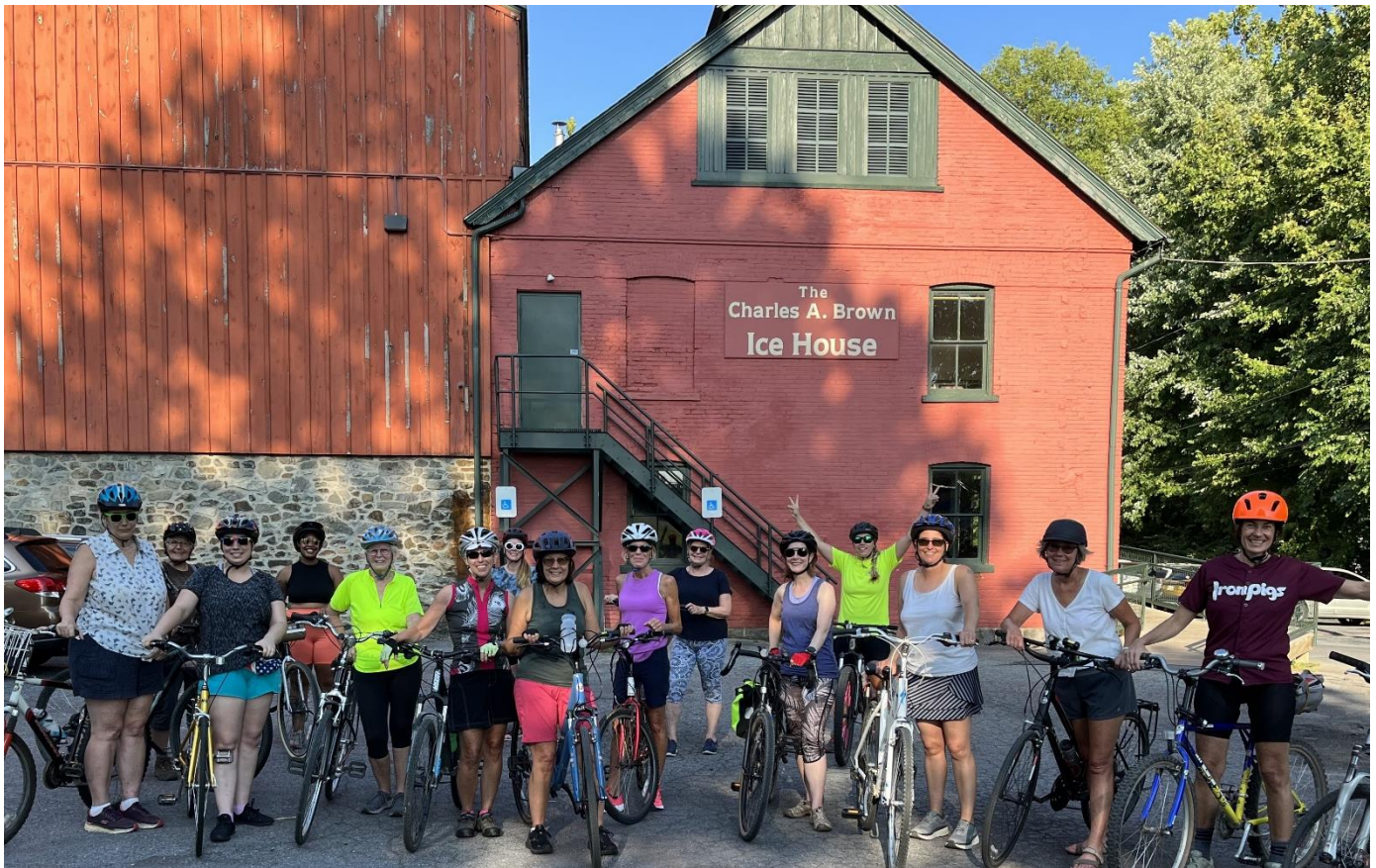
CAT Weekly Women's Bike Ride

These initiatives support a more active lifestyle, greater vitality, and a healthier community for everyone.