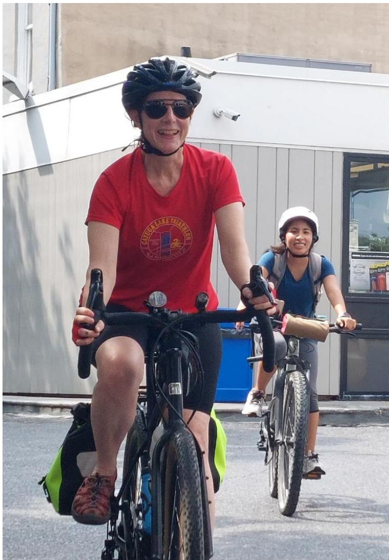
Biking in Southside Bethlehem