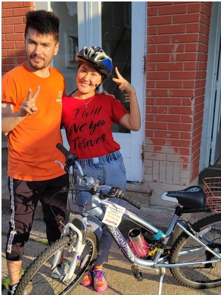
Clients with a CAT-Rebuilt Bike

If you have recently donated, we appreciate your support very much and will do our best to make it go a long way to benefit the community! Thank You!