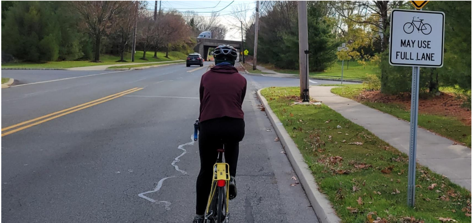
Bicycles May Use Full Lane Sign on Jacksonville Rd

CAT helps people use bikes for transportation, which takes cars off the road! Every dollar supporting CAT goes a long way to help the community. Every person who enters the CAT Bicycle Cooperative or who participates in a CAT program is treated with respect, dignity, and the intention of empowerment through knowledge.