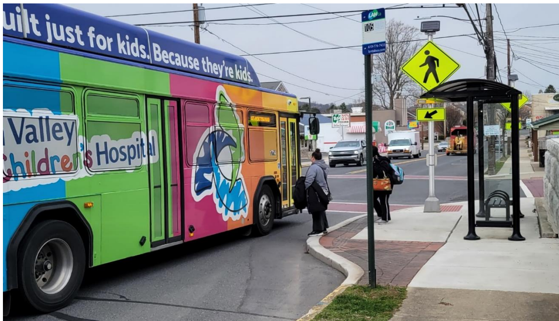
Hellertown Borough's Main Street Pedestrian and Transit Improvements