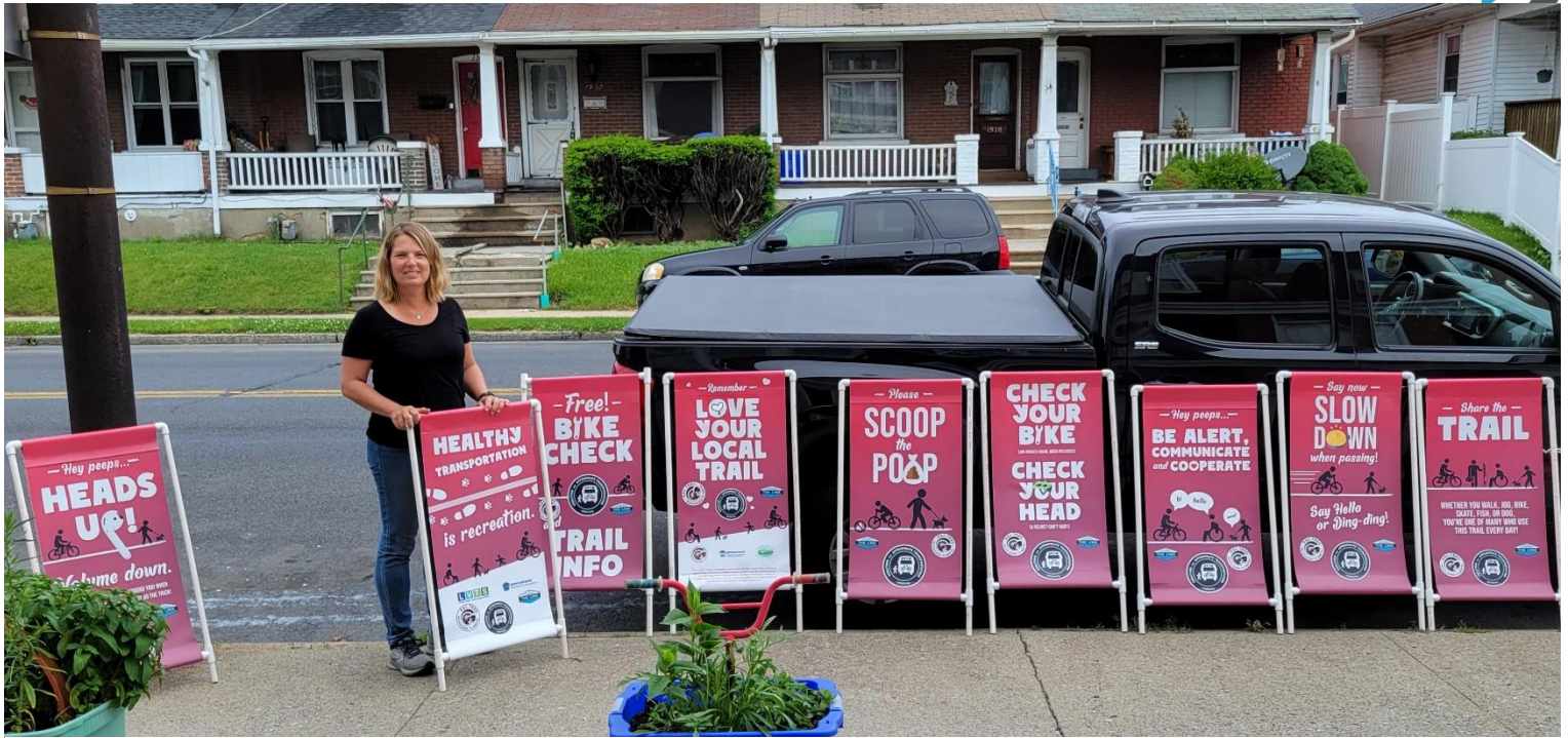
CAT's Trailside Bike Checks Banners (created with Lehigh Valley Greenways)