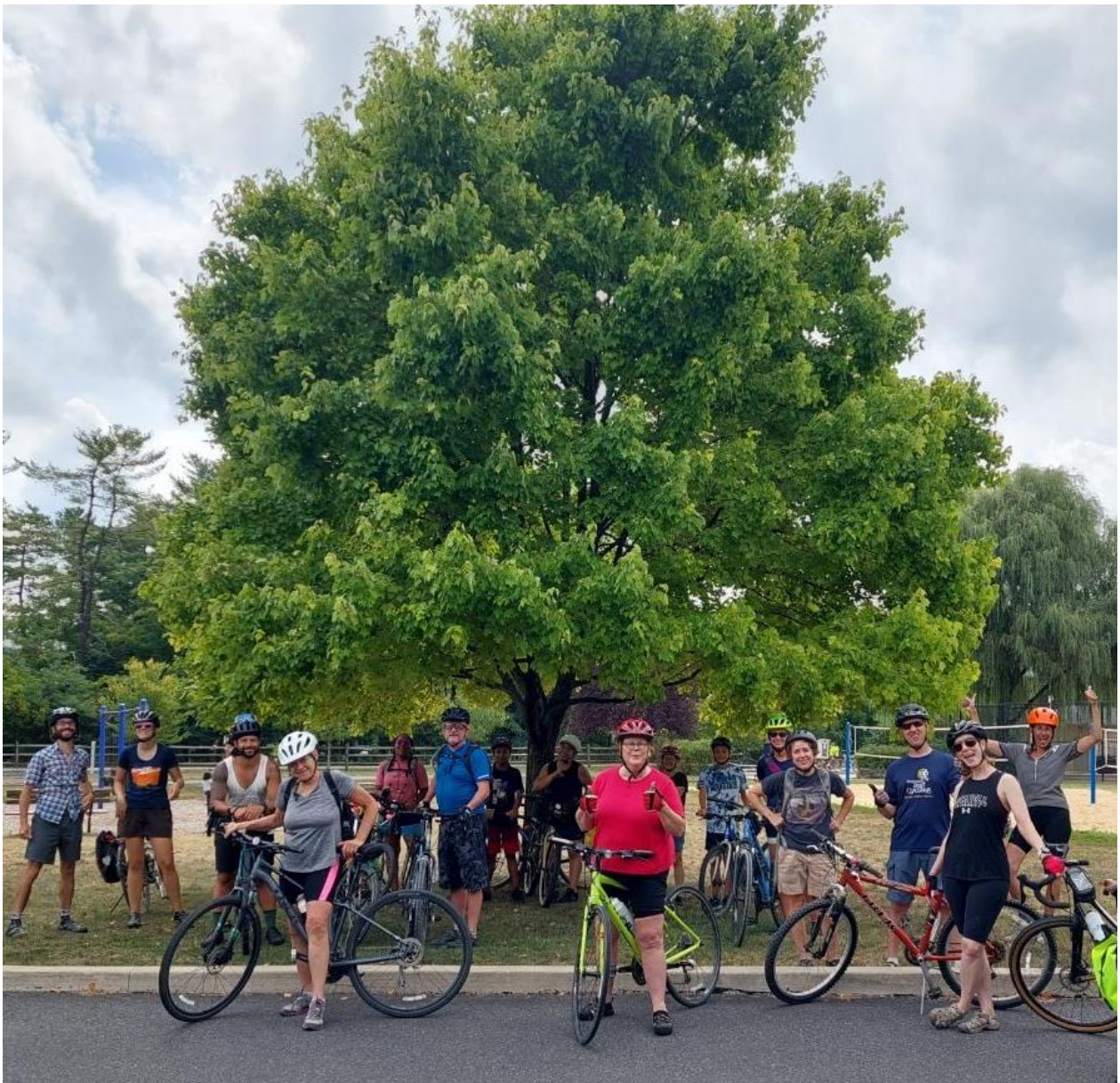
CAT Group Bike Ride From Bethlehem to Coopersburg for Ice Cream